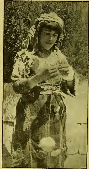
" The Bundle of Rags "